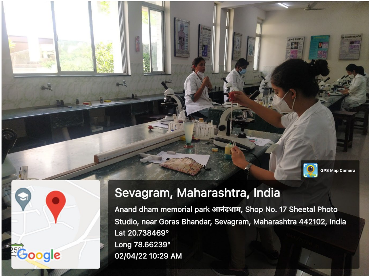
OSPE: Urine examination> Benedict's test